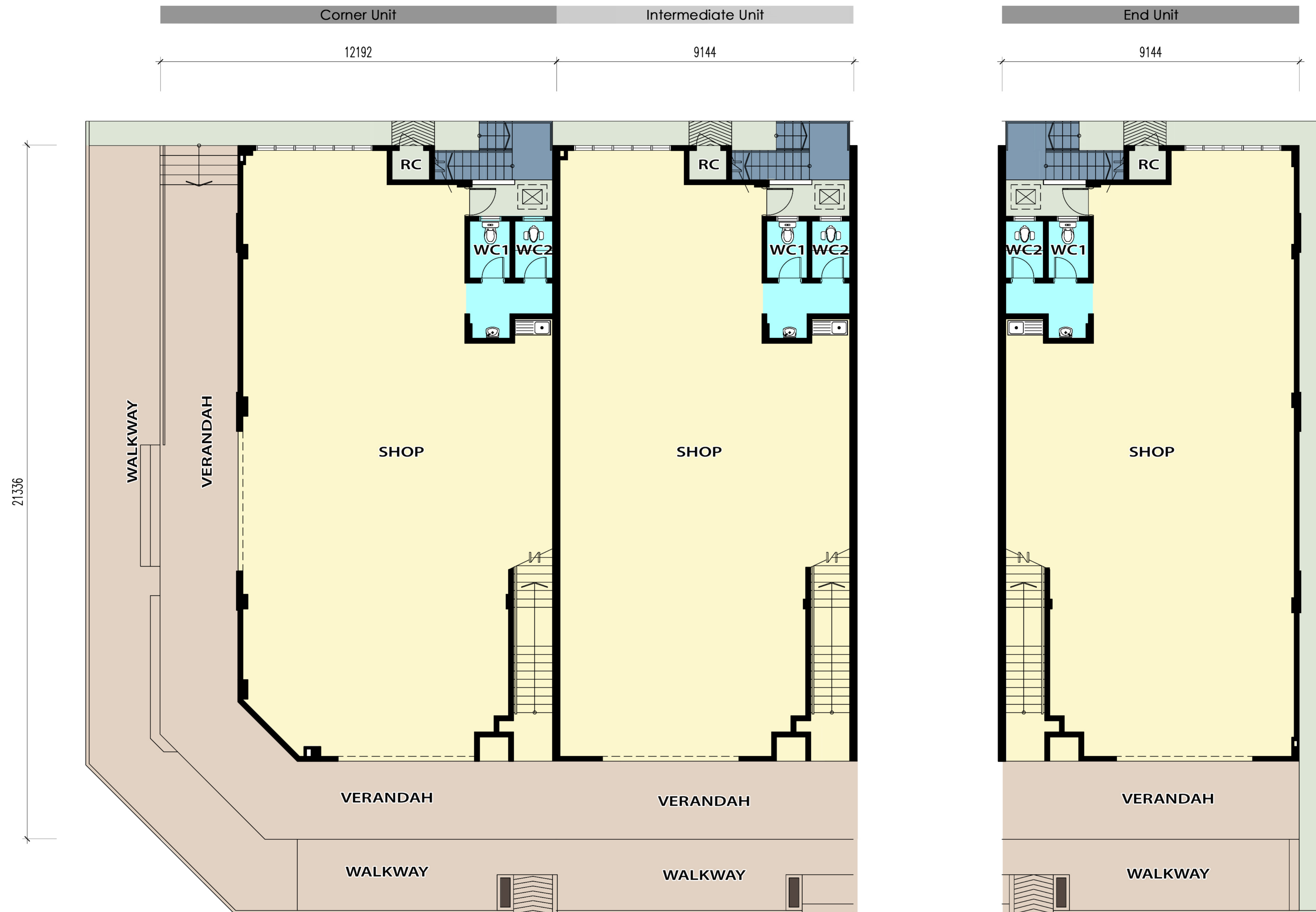
GROUND FLOOR PLAN (BLOCK G, C AND D) SCALE 1 : 125