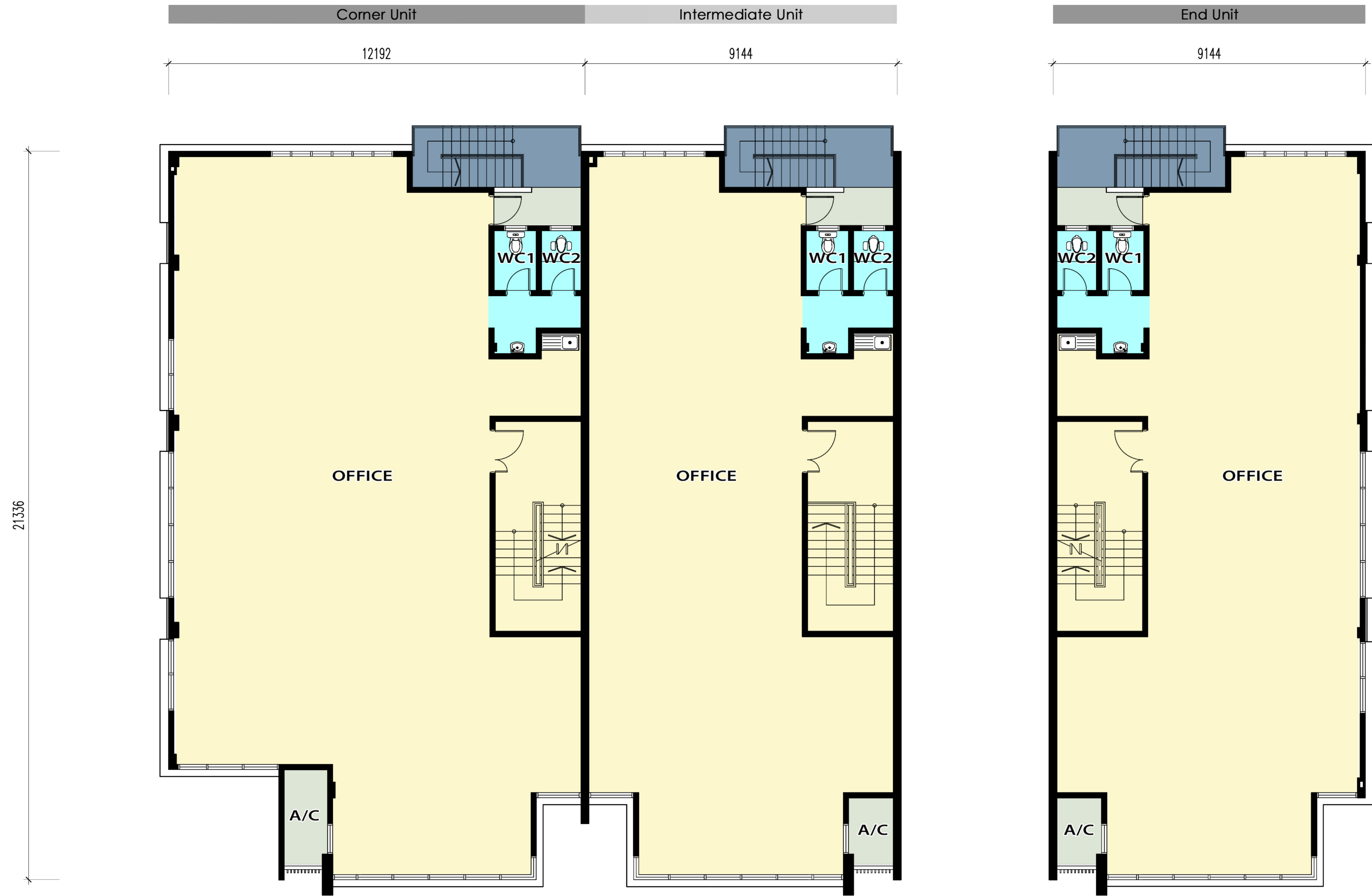
SECOND FLOOR PLAN SCALE 1 : 125