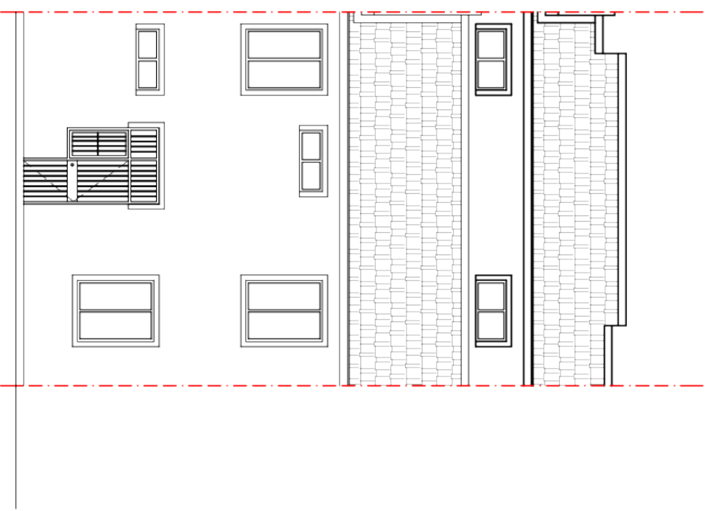
REAR ELEVATION TERRACE - INTERMEDIATE UNIT (TYPE RT3A) APPLICABLE FOR PLOT: PT 29180