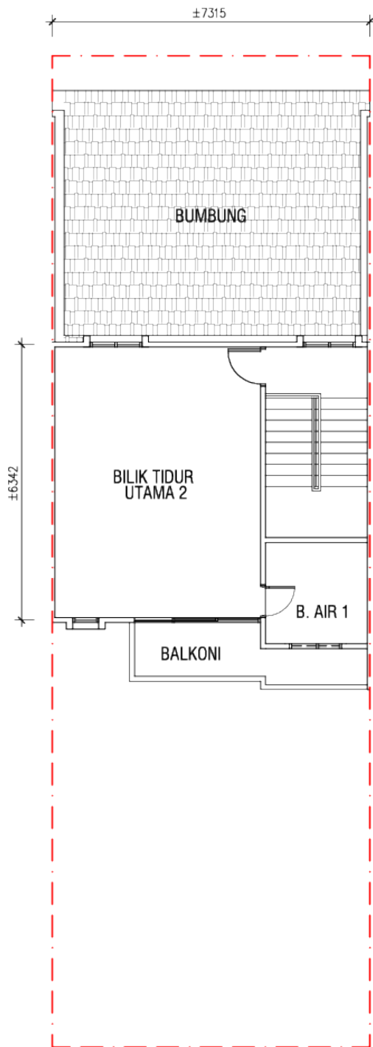
SECOND FLOOR PLAN TERRACE - INTERMEDIATE UNIT (TYPE RT3A) APPLICABLE FOR PLOT: PT 29180